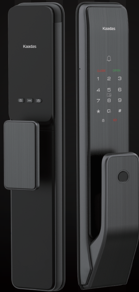
Q3 Push-Pull Lock